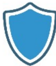
Philosophy of Data Ownership