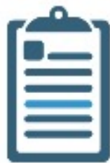
Regulations of Data Sharing